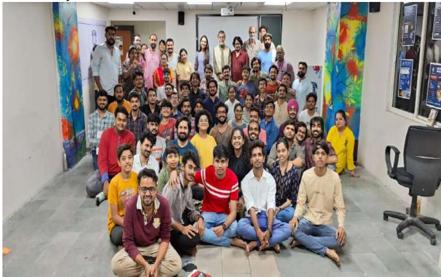
Group photo with Shri Raghuvir Yadav

Description: A workshop was organised for the promotion of Performing arts in which actor Shri Raghuvir Yadav, an Actor was invited and he has conducted workshop for two days.