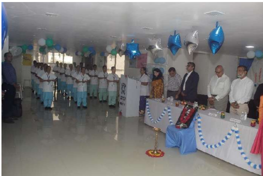
Students taking an Oath before going on posting