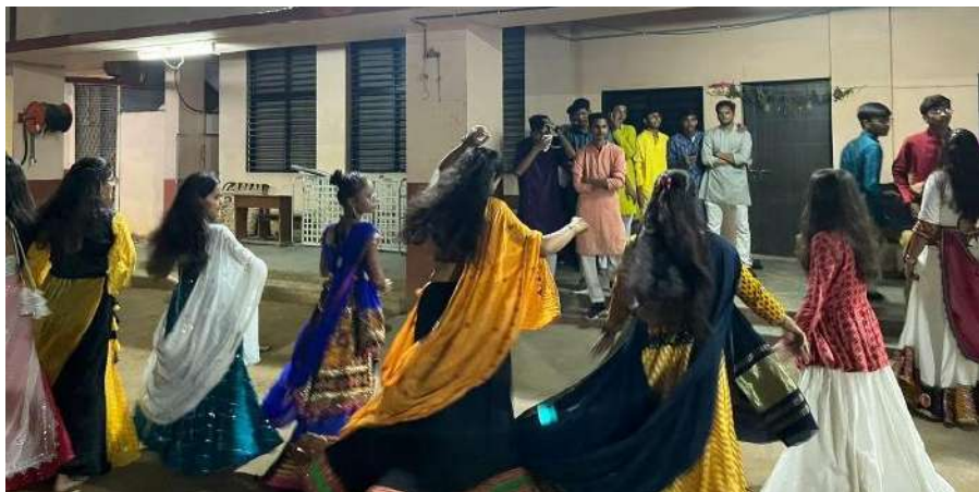
Students of the Shreyarth University playing the Garba