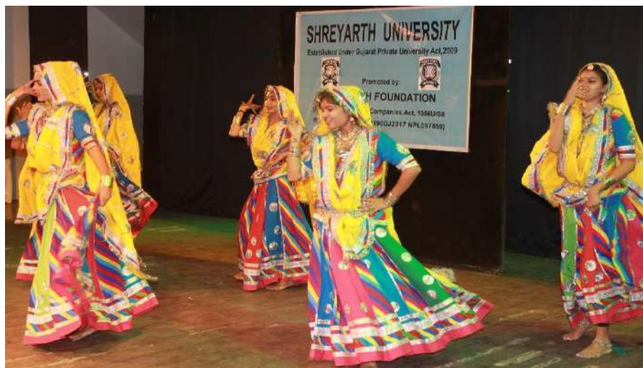
B. Sc. Nursing students playing Ghumar