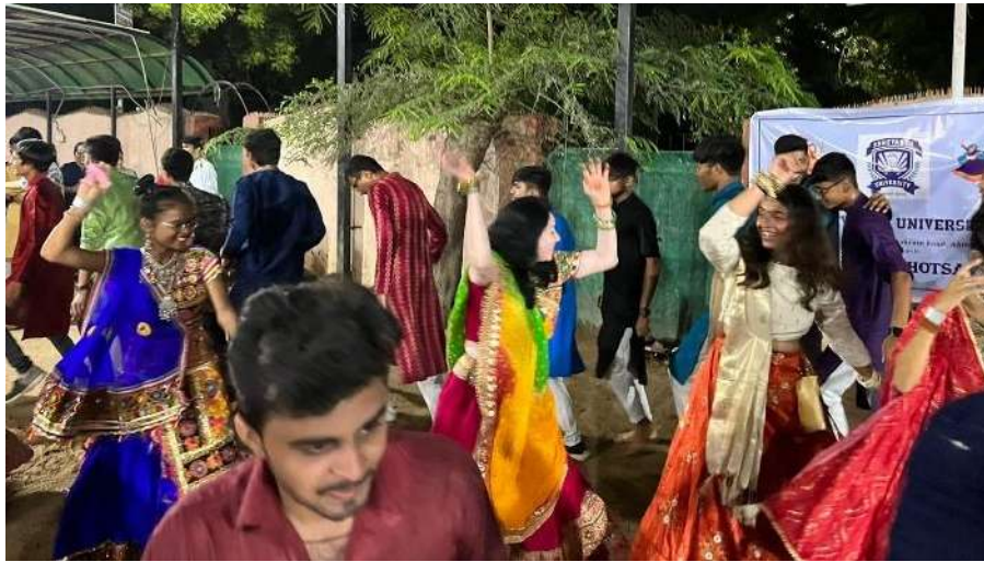
Students of the Shreyarth University playing the Garba