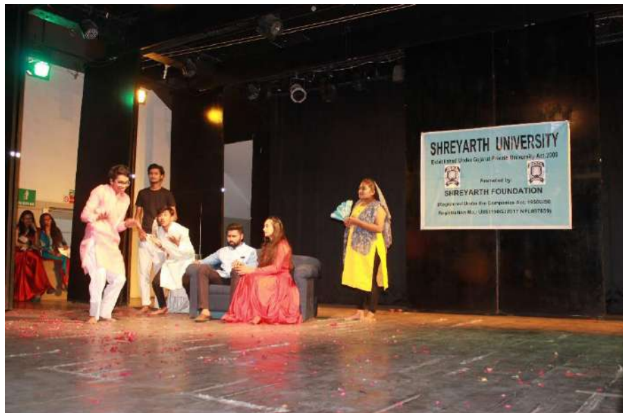
Group of BBA and BCA students performing drama