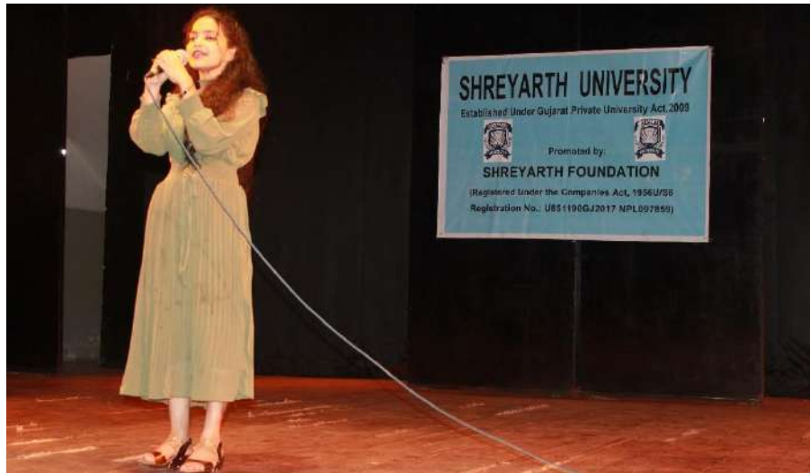
B. Sc. Nursing students playing solo singing