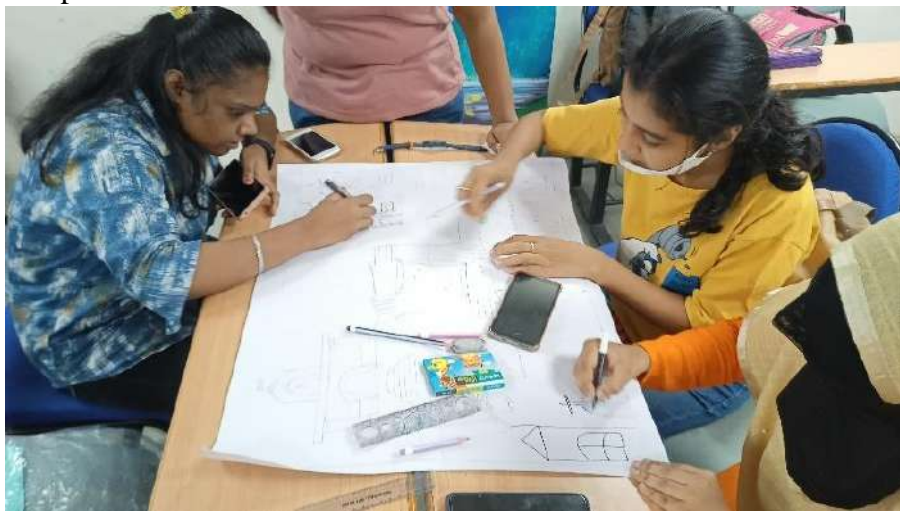
BCA Students making poster

Description: A Poster Making Competition was organised for the students of the University as a part of the 'Azadi ka Amrit Mahotsav'.