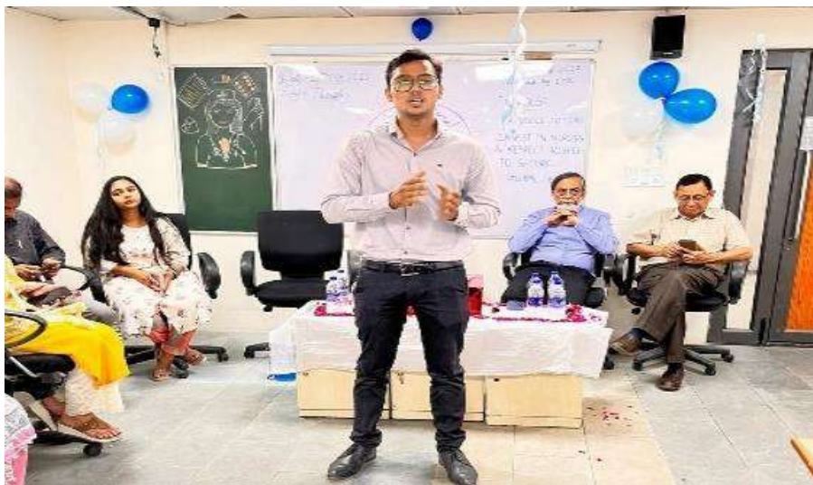
Delegate addressing the students