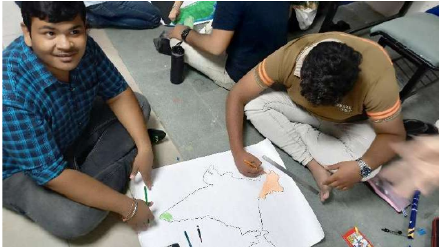
BBA Students making poster