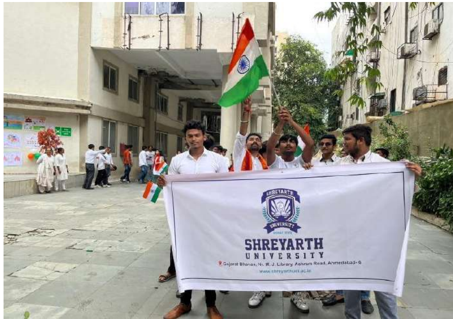
Students doing 'Tiranga Yatra' on the Independence Day