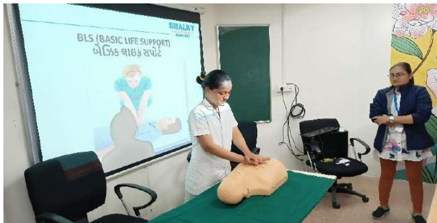
Student doing practical of BLS