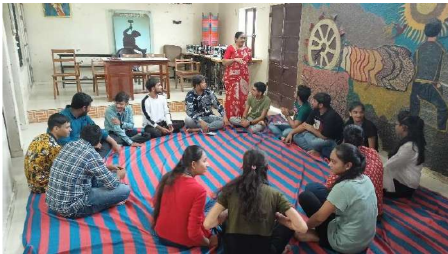
A member of NGO explaining the 'Small Saving' at the NGO

Description: Jeevan-Tirth NGO, or Non-Governmental Organization, is a not-for-profit organization that operates independently from any government and is typically focused on addressing social, environmental, humanitarian, or developmental issues. NGOs play a crucial role in advocating for social change, providing services to communities in need, and promoting sustainable development initiatives. To understand the purpose of the NGO, a visit was organised for the students and our BBA, BCA students have visited 'Jeevantirth' NGO at Vadaj as a part of the field study.