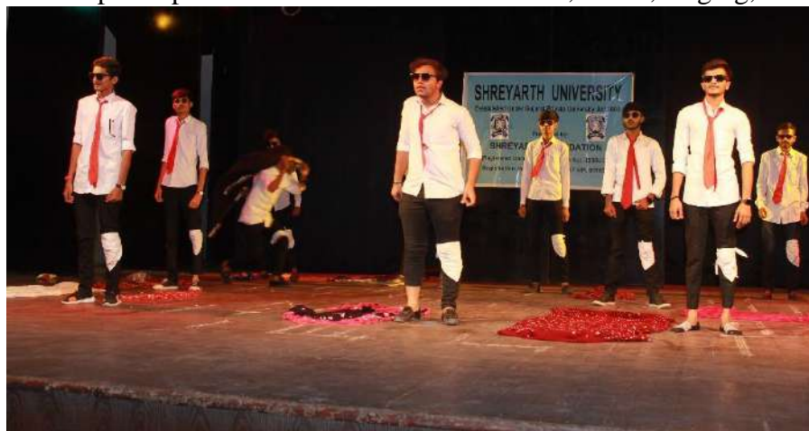
B. Sc. Nursing Students presenting Group Dance

Description: The annual function of a university, also known as the university's annual celebration, is a significant event that typically takes place once a year and serves various purposes within the academic community. Annual function includes Recognition of Activity, cultural performances, Alumni Reunion, Academic Symposium, Networking and Socialising, etc. University has organised its annual/cultural function at the H K Hall, Ahmedabad for its students. Students of all the branches have participated in various events like drama, dance, singing, etc.