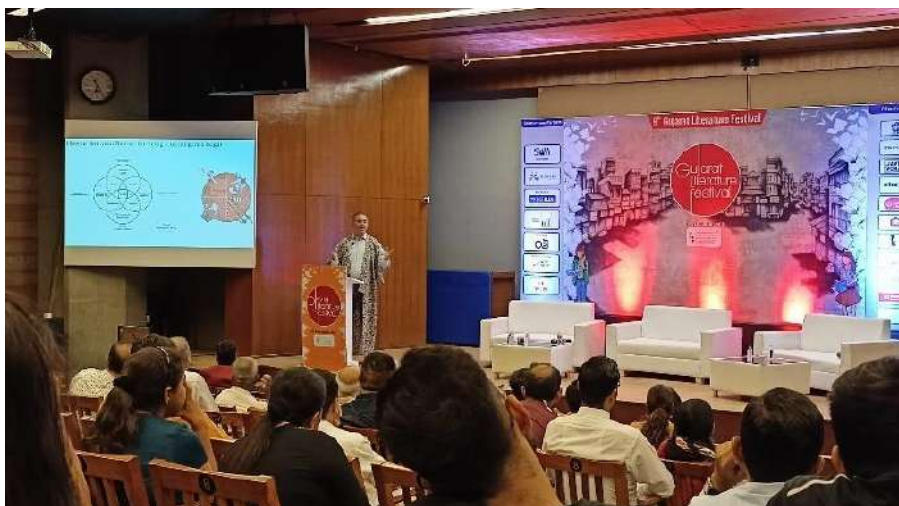
Delegate Expert was explaining the audience about the 'Ikigai'

Description: 9th Gujarat Literature Festival was held from 11 to 13th May 2022 at Ahmedabad Management Association (AMA) to provide a platform for authors, poets, scholars, artists, and cultural enthusiasts to come together to engage in discussions, presentations, performances, and workshops related to literature and various forms of creative expression. Our BBA students have visited 9th Gujarat Literature Festival at AMA, Ahmedabad, there they attended book fair, session on 'Ikigai'.