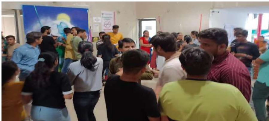
Students playing the Treasure hunt