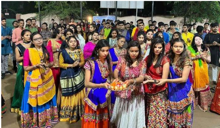
Students of the Shreyarth University doing Aarti