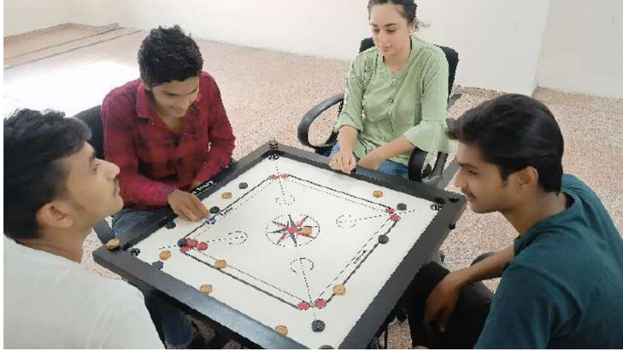
Students of the Shreyarth University playing Carrom