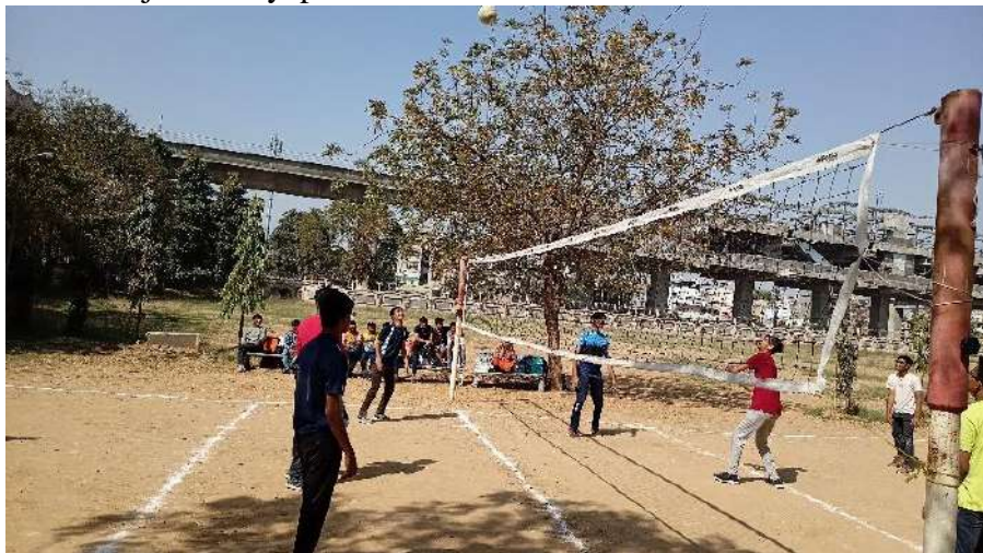
Students of the Shreyarth University playing Wally-ball

Description: University has organised two days sports events for the students of the University in the Gujarat Vidyapeeth Ground.