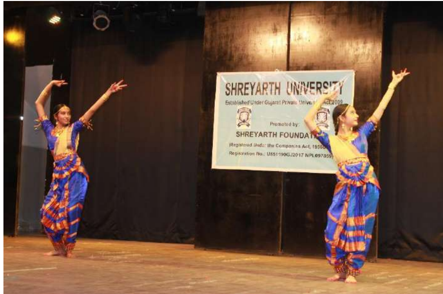
BBA students playing classical dance