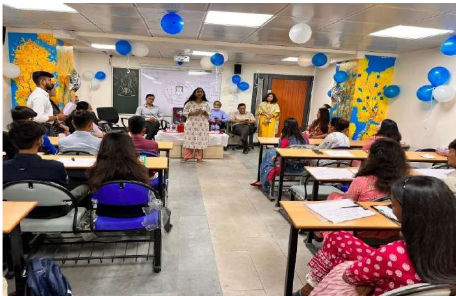
Delegate addressing the students

Description: Nurses' Day is an annual celebration dedicated to honouring and appreciating the contributions of nurses to healthcare and society. It provides an opportunity to recognize the hard work, dedication, and compassion of nurses who play a vital role in patient care, health promotion, and disease prevention. Nurses' Day celebrations can take various forms depending on the institution and community, but here are some common elements often seen in these celebrations like recognition and appreciation, health and wellness initiatives and activities under it, professional networking event, etc. Shreyarth College of Nursing has celebrated International Nurses' Day and invited delegates from Hospitals and spreaded awareness to the students.