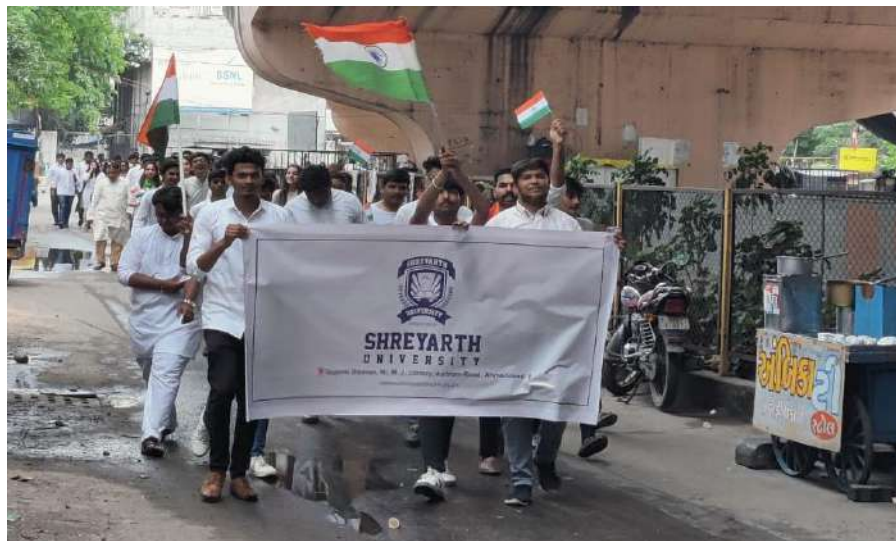
Students doing 'Tiranga Yatra' on the Independence Day