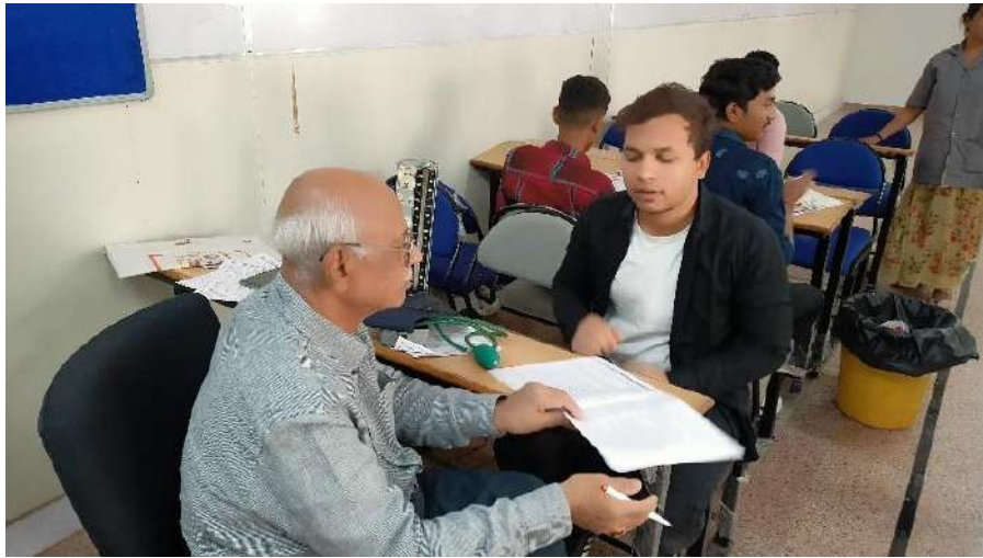
Member came for the blood donation were taking information from the student

Description: A blood donation camp was organised by the Shreyarth College of Nursing in association with HDFC bank.