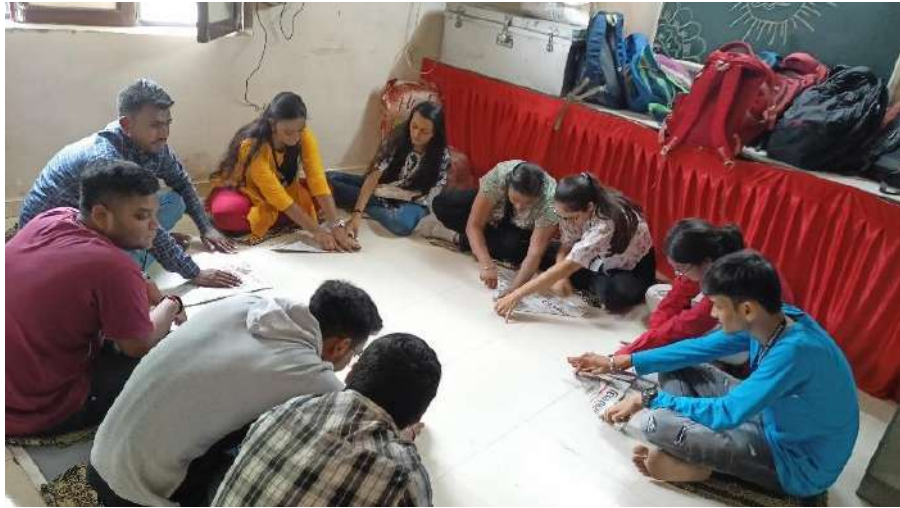
Students were given activity to perform at the NGO

12. Name of the Event: Poster Making Competition