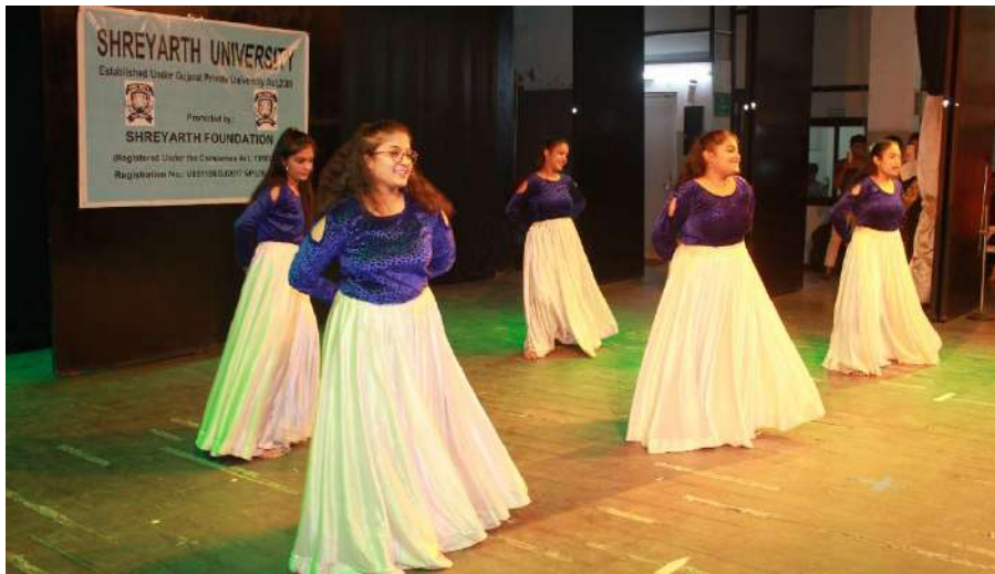
BBA Student playing group dance