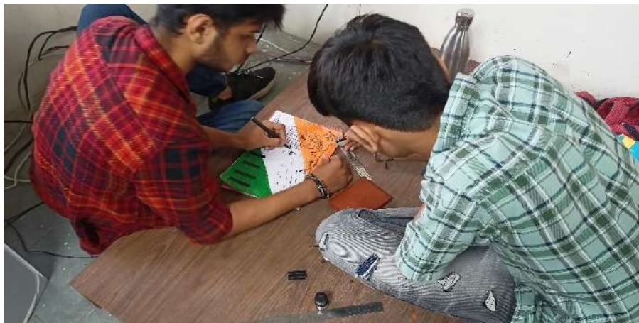
BCA Students making poster