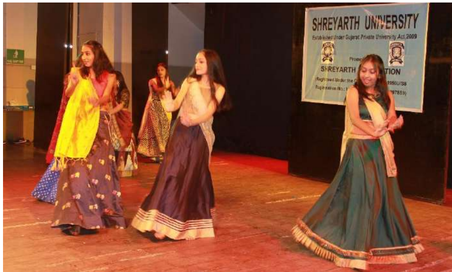
BBA students playing group dance