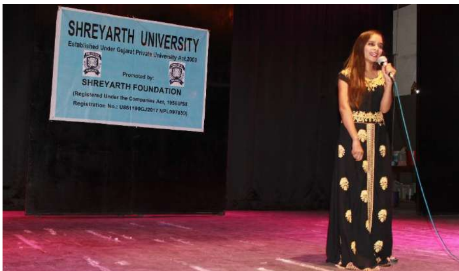
B. Sc. Nursing student playing solo singing