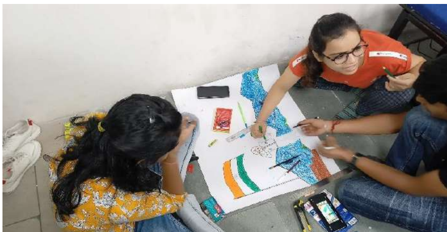
BBA Students making poster