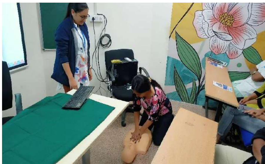
Student doing practical of BLS